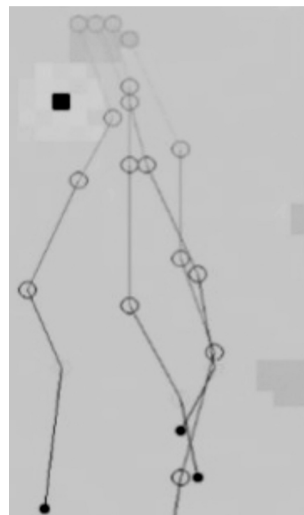
Figure 2. Migrations of Herds (Circle) From One Watering Hole (Square) to Another (Off Screen)

would define the interaction between the two teams throughout the collaboration, sometimes with comical results. The anthropologists are always coming up with the exception to the rules that