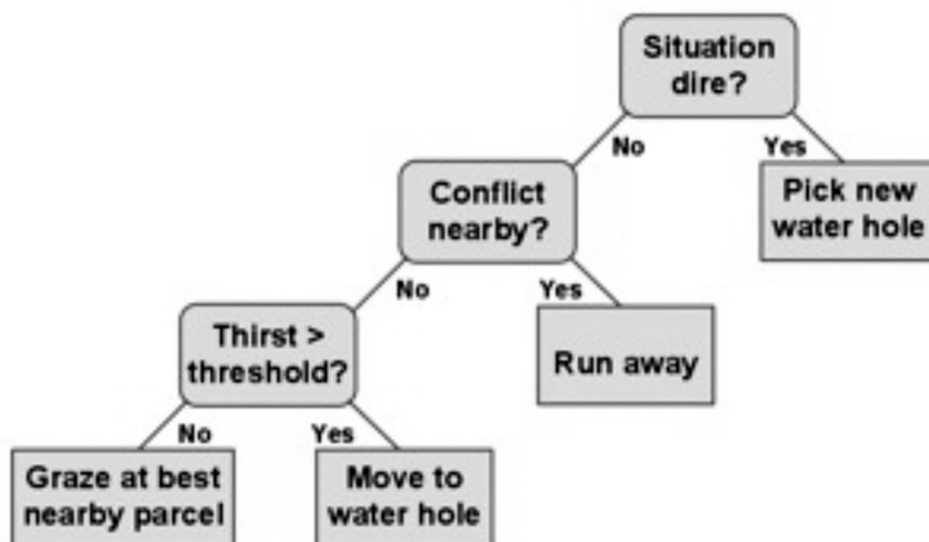
Figure 1. Herding Decision Making Tree

Based on their knowledge of ethnographic data of the region, the anthropologists then critiqued the strict division between herders and farmers and suggested an agropastoralist agent who would combine both subsistence practices. This suggestion proved a challenge to the programmers who could assign only one of the two subsistence activities to an agent. One possible solution considered was to have the agent switch between subsistence activities for different units of time: a farmer today and a herder tomorrow. However, a more realistic solution to the problem was to introduce the